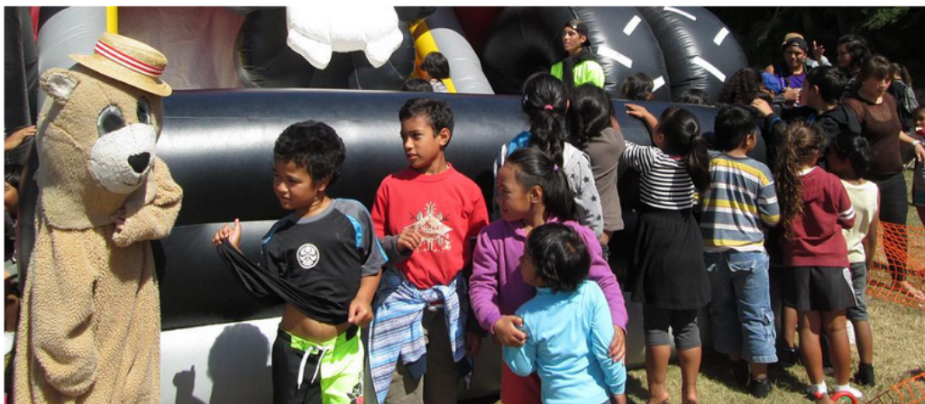
Creekfest bouncy castle action on Saturday 8 March 2014.